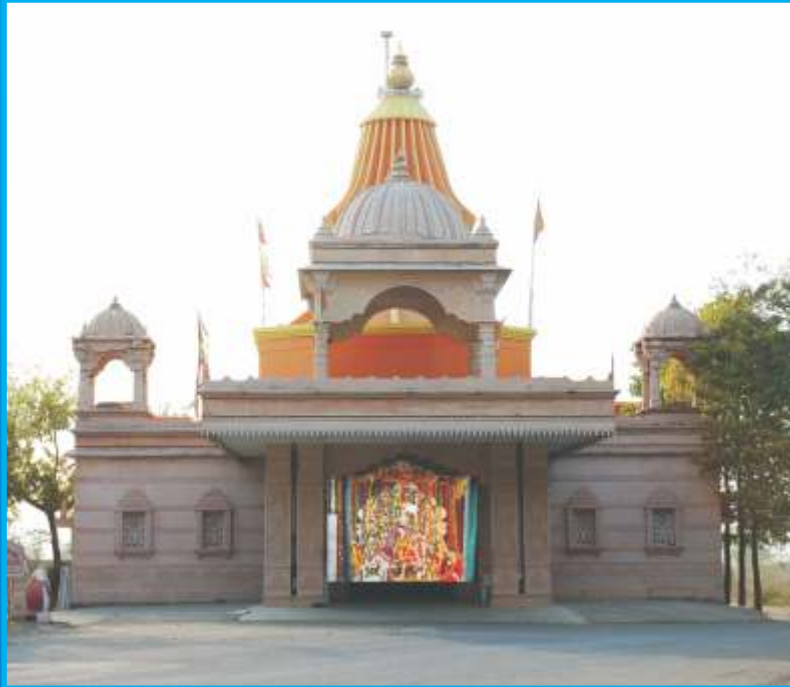
Shri Ramdeobaba Temple on Campus