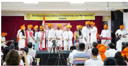
Independence Day 2022