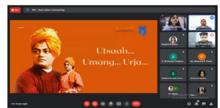
National Youth Day