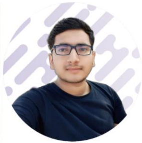
RCOEM students are the winners of Hack The Game at IIT Goa