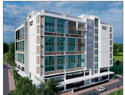
PROPOSED DIGITAL TOWER SHRI RAMDEOBABA COLLEGE OF ENGINEERING AND MANAGEMENT