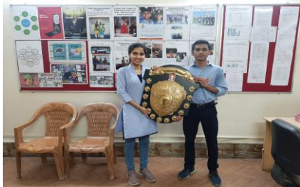
RCOEM students won Late Shri J.M. Thakar Memorial Inter-Collegiate award