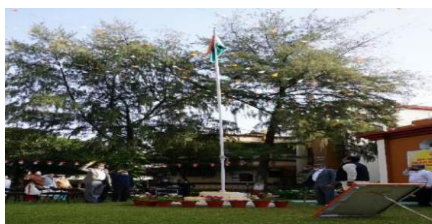
Republic Day 2022