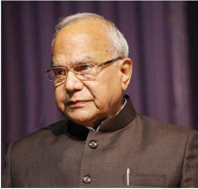
H.E. BANWARILAL PUROHIT