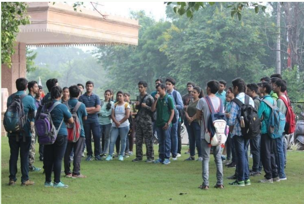
REEFians interacting with new REEF members, REEFlings