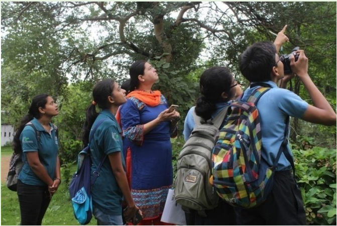
Students of Centre Point School during the bird race at Gorewada Biodiversity Park

Global Tiger Day (GTD) is marked on 29 th July every year to create awareness about decreasing tiger population and its conservation on a global level. This year REEF focused at encouraging schoolchildren to contribute towards tiger conservation. Past 2 years REEF has been organising an interschool competition on GTD. The competition named as 'How Green Is Your Campus? - Challenges beyond Boundaries' comprised of various activities to inculcate sense of responsibility towards environment and tiger conservation in the young blood. REEFians approached various schools in the city and amongst them 11 schools participated in the competition. All the activities were divided into two categories- 'within boundary' and 'beyond boundary'. Both of the categories had some compulsory and some optional activities. Activities like making a wall art, organising a competition, performing a cultural act, making a digital herbarium, making an awareness video etc. were included under 'within boundary'. And tasks like cleaning campaign, tiger rally, awareness in NMC schools, and research and bird race were included under 'beyond boundary'.