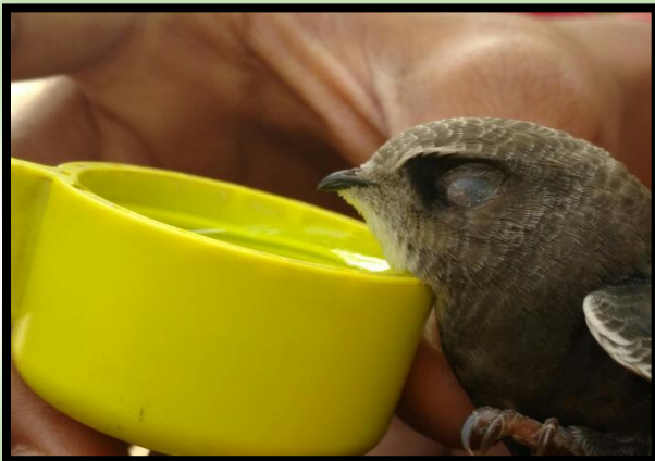
The rescued baby House swift drinking water