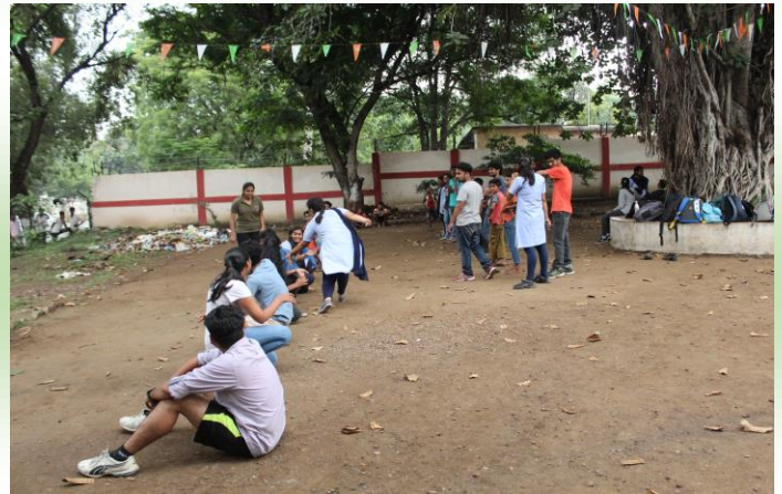
REEFians and the kids during the fun activity