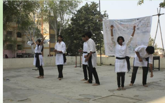
The Music club (left) and Nautanki-the drama club (right) performing during the event