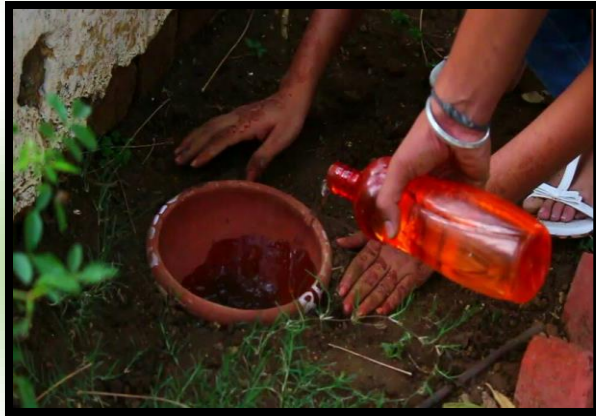
Bird baths being refilled