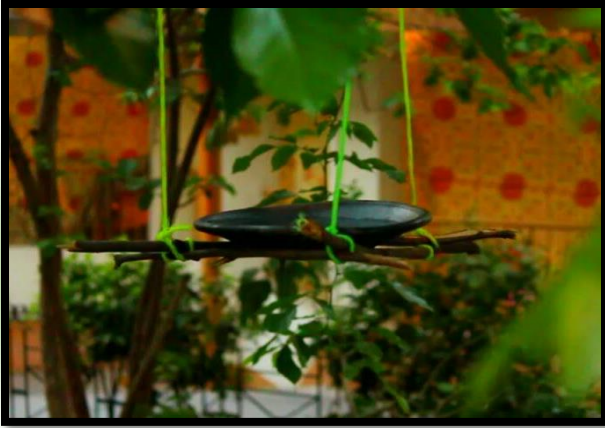
Hanging bird baths installed by REEF