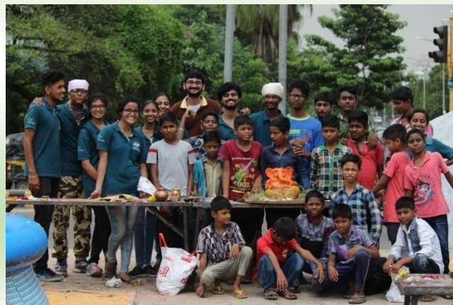
REEFians and the kids of Balsadan with the eco-friendly ganesh idol on the Visarjan day at Police Line Takli Lake

This year REEFians witnessed 529 immersions out of which 396 were clay idols and 133 were PoP idols. This implies that 74.8% idols were made of clay. On the last day of the festival, the percentage of immersion of clay idols was high as compared to PoP idols, this indicated that people are becoming aware of the consequences of PoP idols on the environment. Last year, 31.25% of the idols immersed at the lake were made up of PoP whereas it reduced to 25.2% this year. REEFians were successful in their initiative as none of the idols were immersed in the lake and the Nirmalya was disposed properly. The REEF team included 22 members working tirelessly to meet their goal of creating awareness, and monitoring the immersion of idols in artificial tanks with the help of Nagpur Police and NMC. Before the festival began, REEFians made school students aware of using clay idols by conducting presentations in Bhavan's Bhaganwandas Purohit Vidya Mandir (BVM, Trimurti Nagar), Center Point School (CPS, Dabha) and T.B.R.A.N's Mundle English Medium School. These presentations were conducted to help the students distinguish between clay and PoP idols, understand the significance of the festival, its history and how the demand and supply of pop idols has increased in the market over the year.