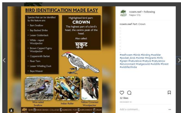
A template from Bird Identification series posted on Instagram