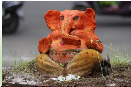
Ganesh idol made with Balgram kids on occasion of Ganesh Chaturthi

Ganesh idol making: The resident children of Balgram made the idol of Ganesh with the help of REEF members