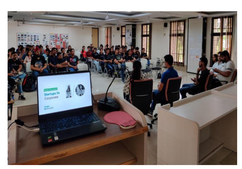
Panel discussion in session-2