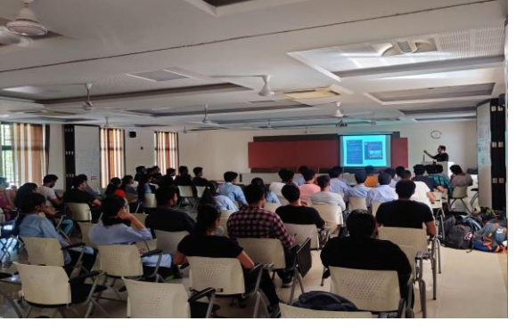
Participants attending the mentorship Session on Artificial Intelligence, Machine Learning and Data Science