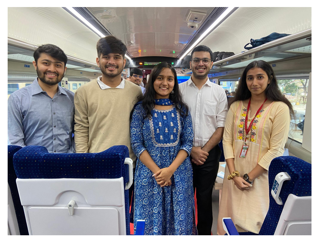
Students in C1 coach