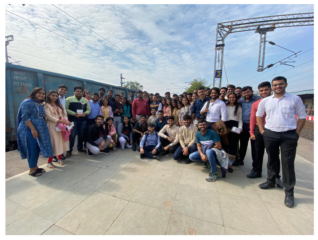
Students at Kamptee Station