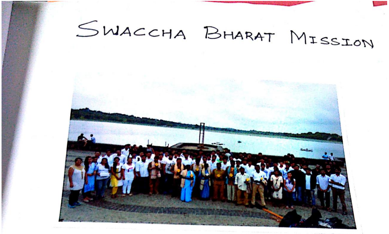
Swaccha Bharat Mission Program conducted by Civil Dept on 2nd October, 2016 at Futala Lakeside