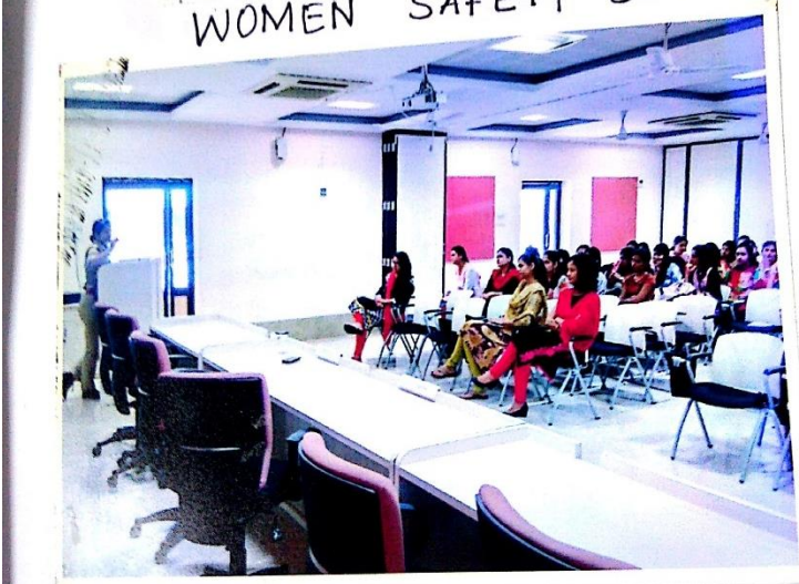
Women Safety talk conducted by Deputy Commissioner of Police Ms. Deepali Masirkar on 29/09/2016