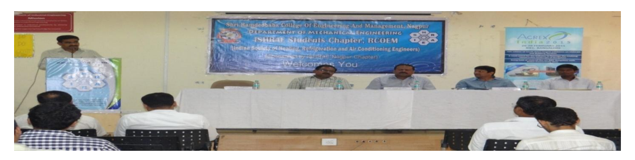
ISHRAE Students Chapter Installation 2013-14