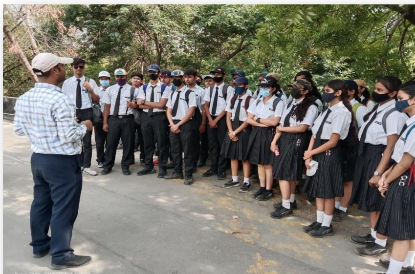
Bhavan's Vidya Mandir School, Shrikrishna Nagar & Koradi, held on 19 th – 20 th April 2022