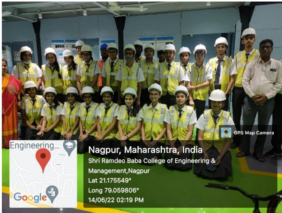
Bhavan's Vidya Mandir School, Civil Lines, held on 14 th – 15 th June 2022