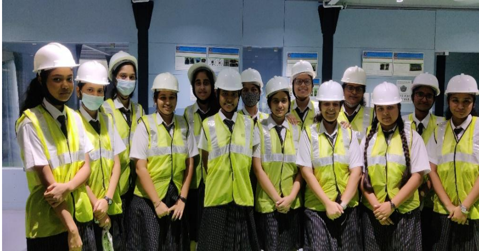
Bhavan's Vidya Mandir School, Civil Lines, held on 16 th – 17 th June 2022