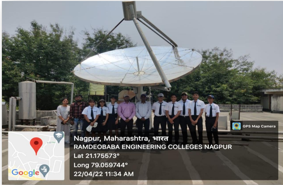
Bhavan's Vidya Mandir School, Ashti, held on 21 st – 22 nd April 2022