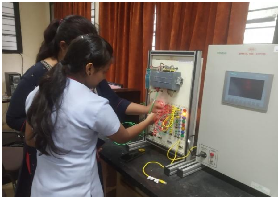
One Month Internship Program conducted from 1 st – 30 th June 2022