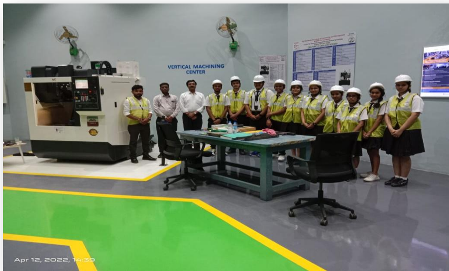
Bhavan's Vidya Mandir School, Trimurti Nagar, held on 12 th – 13 th April 2022