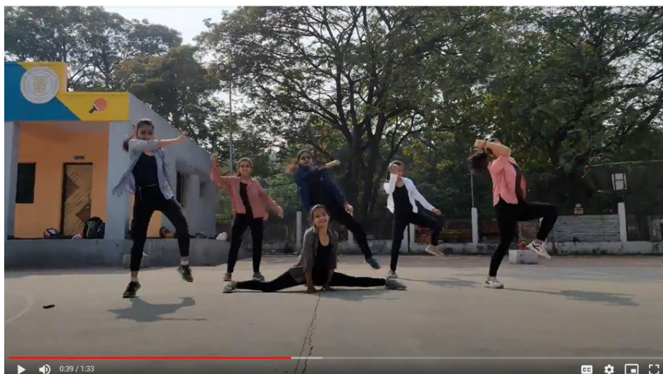
Category: GROUP DANC