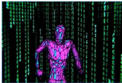
The winning entries of the Graphic designing event