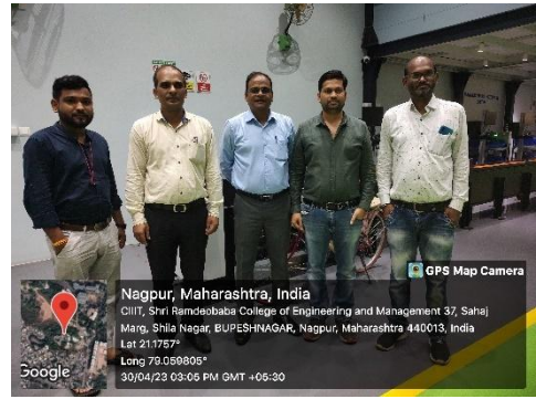
Faculties of Government Polytechnic, Chandrapur