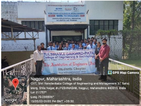
Tulsiramji Gaikwad Patil College of Engineering & Technology, Nagpur