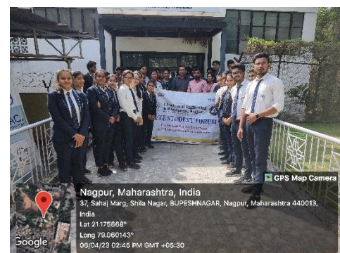
J D College of Engineering & Management, Nagpur