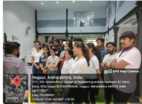
RCOEM Electronics Dept., Nagpur