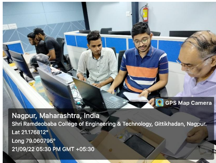
Students working on remote health care and diagnostics project