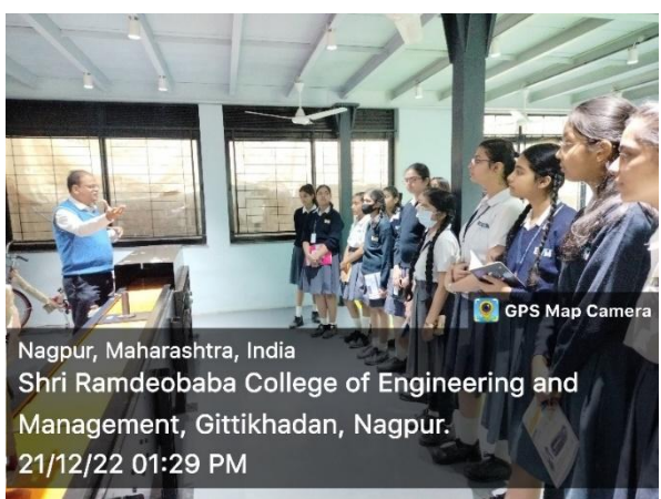
BVM School, Civil Lines, Nagpur.