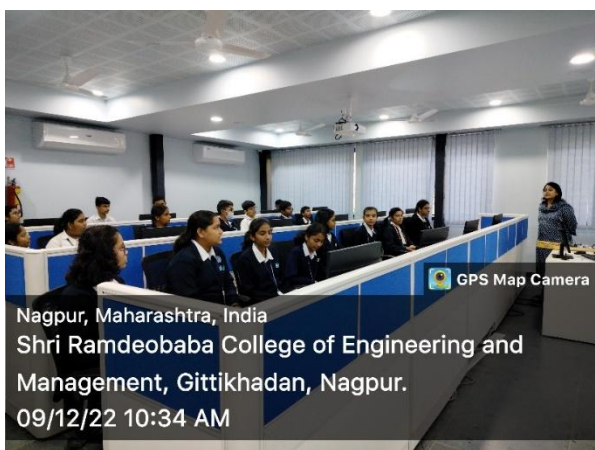
BVM School, Trimurti Nagar, Nagpur