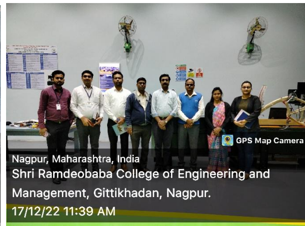
Heads of Gaikwad Patil College of Engg. & Tech