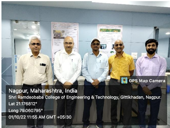
HoD's of St. Vincent Palloti College of Engg.