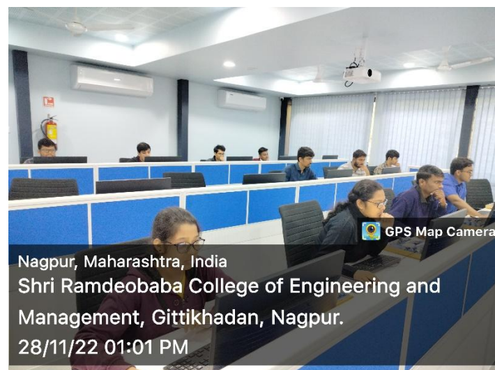
Conduction of End Semester Practical exam on Internet of Things