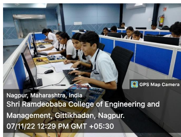
BVM School, Srikrishna Nagar, Nagpur BVM School, Koradi, Nagpur