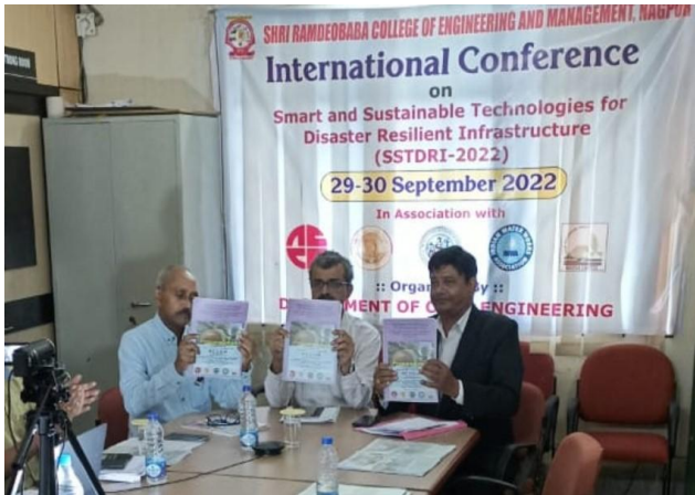
Unveiling of Conference Proceedings